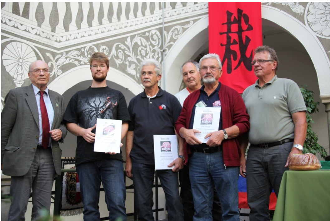
St.Veit Bonsai Exhibition; Presentation of Awards