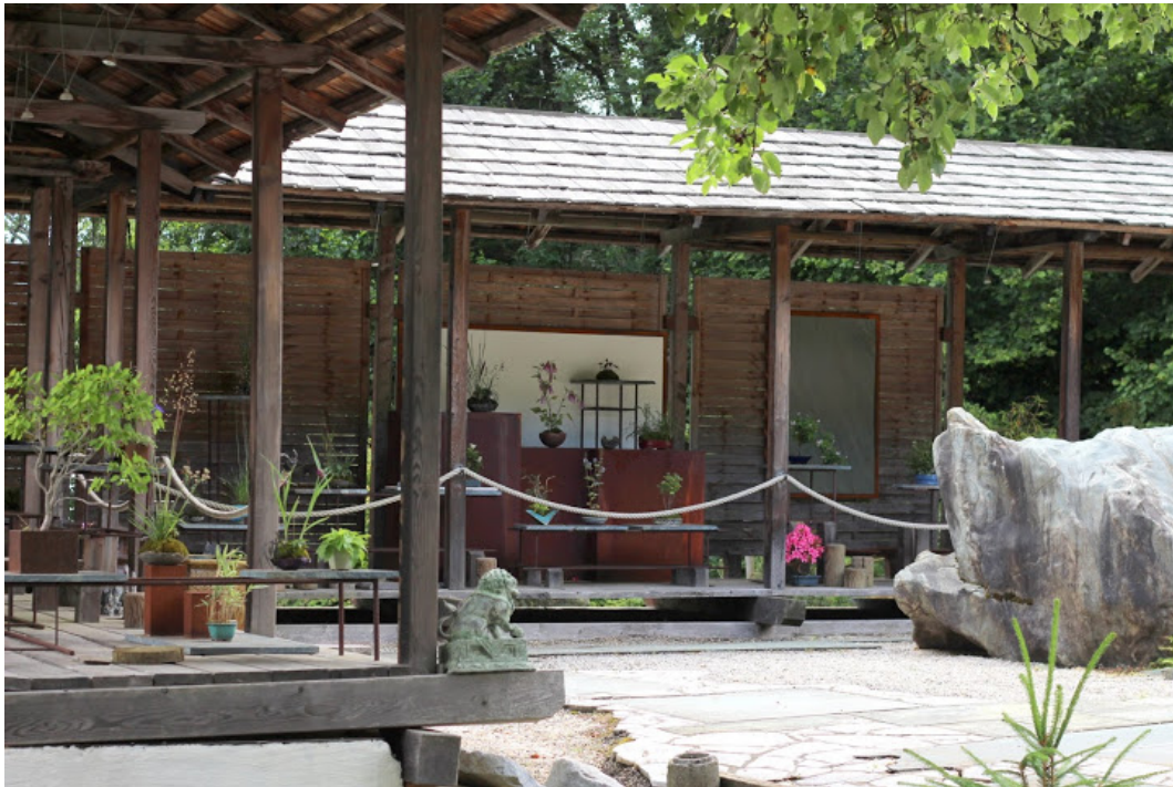
Bonsai Museum Seeboden; Exhibition of Kusamono