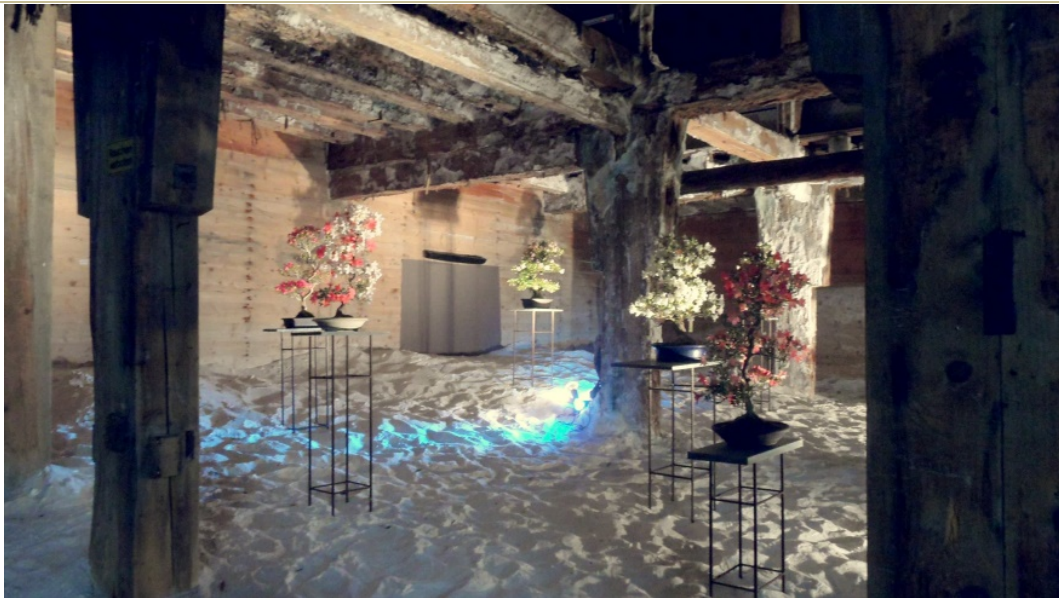
Hallein Bonsai Exhibition 2015; Ancient Salt Storehouse