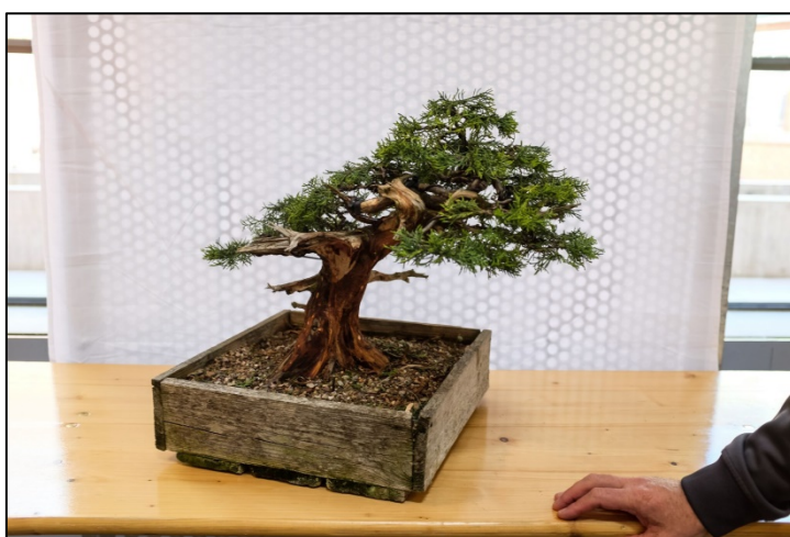
Result of Styling a Juniper