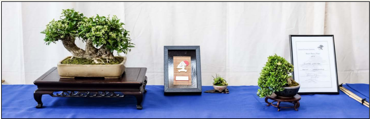
Best Kifu Composition 2015 Denmark (