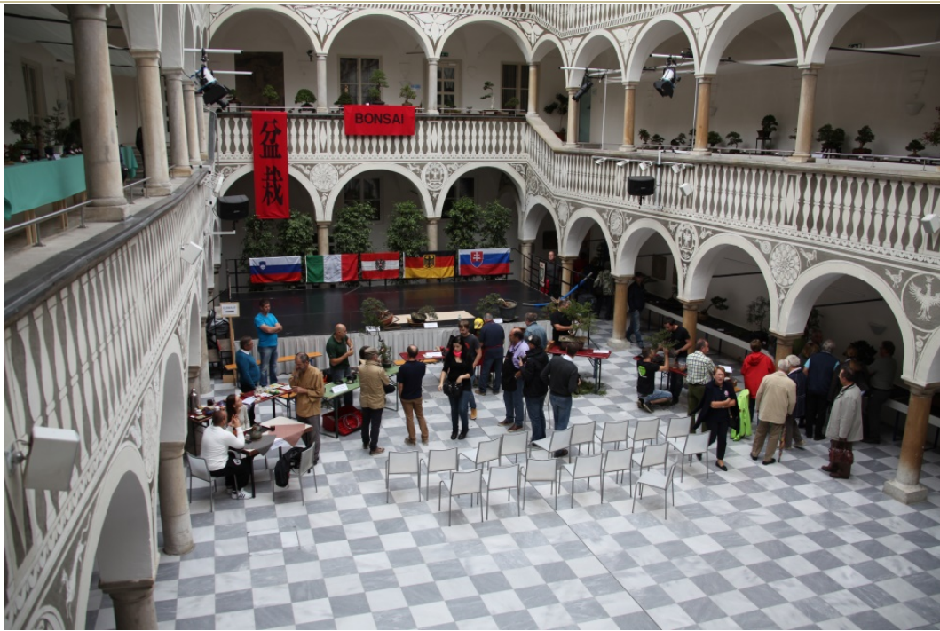
St.Veit Bonsai Exhibition; Renaissance Town Hall