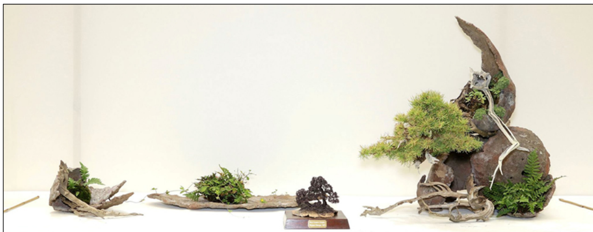
Best Creative Composition bonsai Europa 1