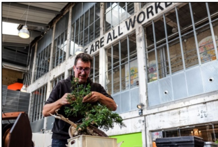
Styling a Juniper.