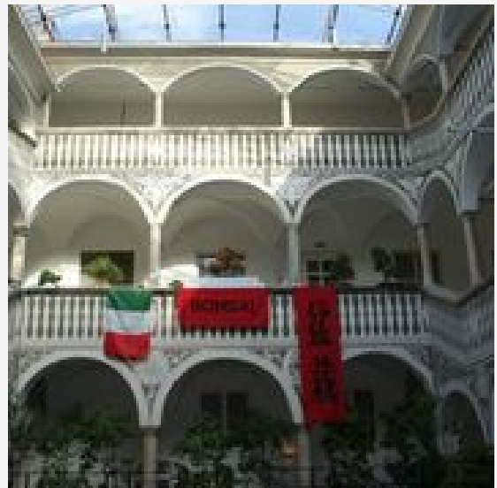
6th International. Alps Adria Bonsai Exhibition