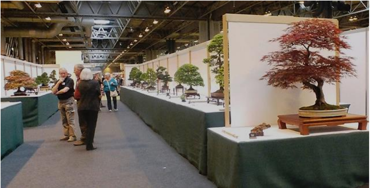
Gardeners World Live, FoBBS stand

Gardeners' World Live, National Exhibition Centre, Birmingham: 11 th – 16 th June.