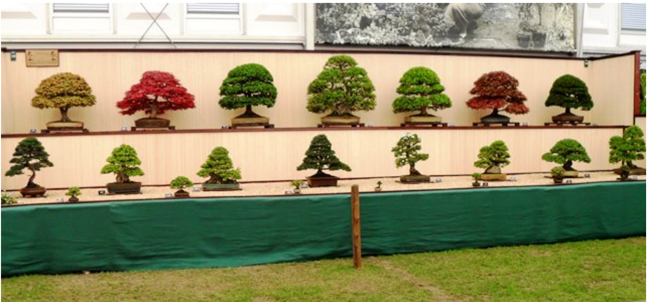
Chelsea Stand 2013

For the first time, a major display of shohin trees was exhibited in this part of the country and it attracted a large number of enthusiasts. It is hoped that this event will, in future, take place every other year, alternating with the already established British Shohin Association show which is held in the north-east of England in the early spring.