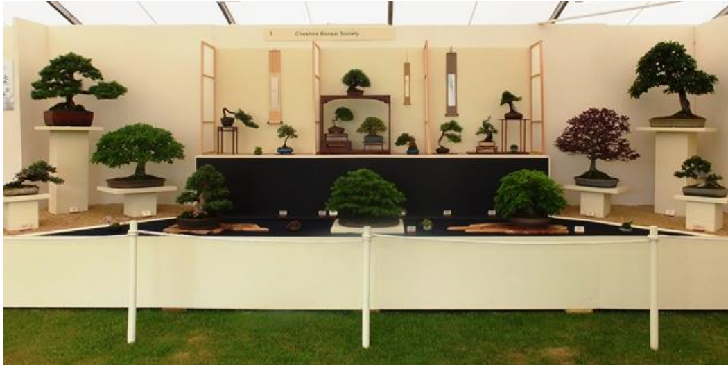
Cheshire Bonsai Society stand Tatton Park

Throughout the season there are many local society shows, as well as major events which take place nationally and attract much public interest. These included: